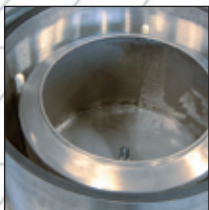
Cesto in acciaio inox AISI 304. Stainless steel basket AISI 304.