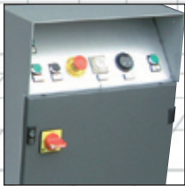
Armadio elettrico. Control panel.