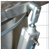
Apertura pneumatica coperchio. Pneumatic opening of the lid.